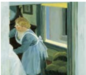
Apartment Houses by Edward Hopper, 1923 The Pennsylvania Academy of the Fine Arts, Philadelphia John Lambert Fund